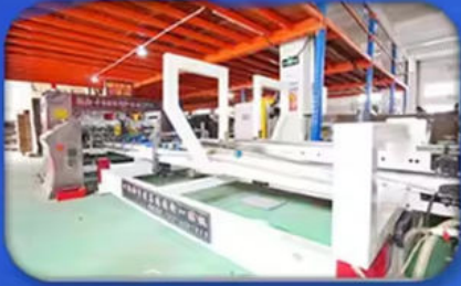
Advanced assembly machine