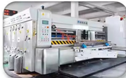
Advanced assembly machine