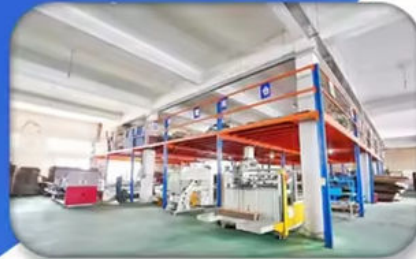
Paper box workshop