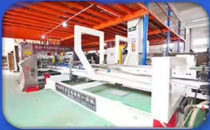
Advanced assembly machine