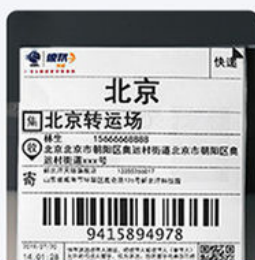
-Express face sheet-