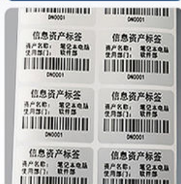
-Dumb silver paper-