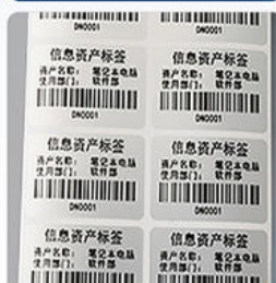
-Dumb silver paper-