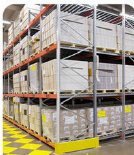
Normal temperature cold storage