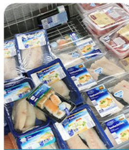
Frozen fresh food