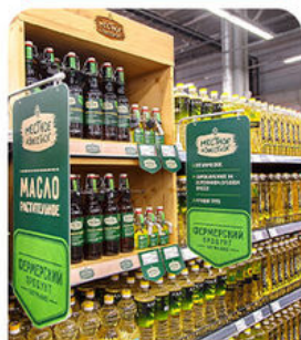
Low temperature cold drinks