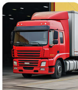
Cold chain transportation