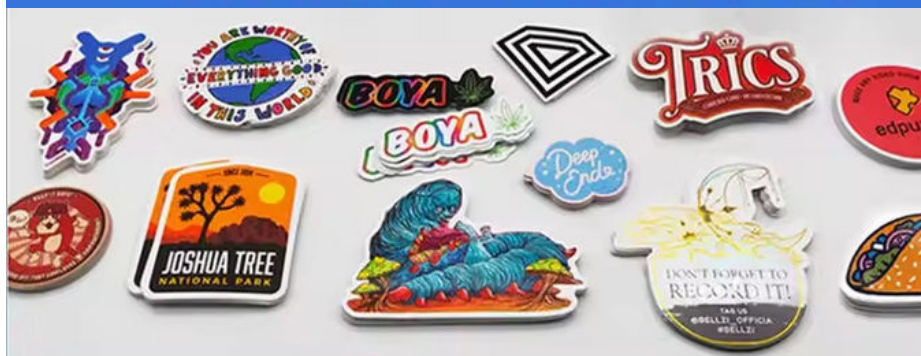
Silver Foil Vinyl Sticker