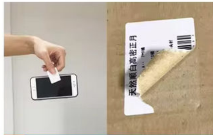
5 strong adhesive

Click Here To Send An Inquiry Immediately!