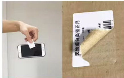
5 strong adhesive

Click Here To Send An Inquiry Immediately!