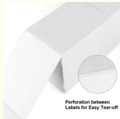
Perforation between Labels for Easy Tear-off