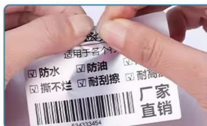
Unable to tear apart