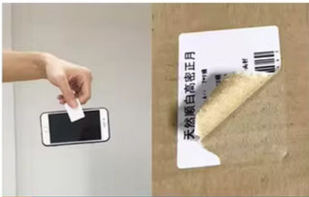
5 strong adhesive

Click Here To Send An Inquiry Immediately!