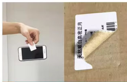
5 strong adhesive

Click Here To Send An Inquiry Immediately!